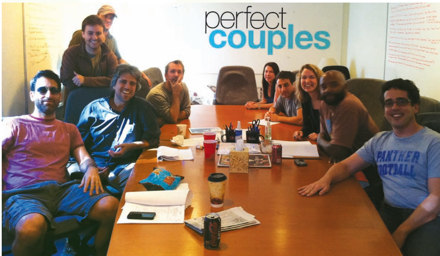
The writing team of Perfect Couples .

Even Perfect Couples have their issues. In this new single-camera romantic comedy from NBC, a trio of engaging couples takes a comedic trial and error approach to life, love, and relationships. Dave (Kyle Bornheimer, Worst Week ) and Julia (Christine Woods, Flash Forward ) are the “normal” couple who sometimes sacrifice their own happiness to appease their friends. Vance, (Dave Walton, 100 Questions ) Dave’s needy best friend and his neurotic girlfriend Amy (Mary Elizabeth Ellis, It’s